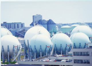
Oil refineries, plants producing basic petrochemical products

Extensive lineup of models for any location!