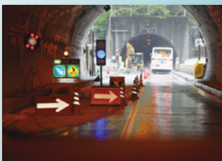
Service and utility tunnels, construction sites