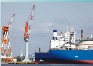
Shipping and offshore facilities